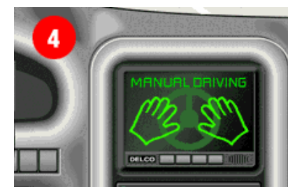
Leave AHS Lanes - Logout

Necessary prerequisite: Car-to-Car and Car-to-Infrastructure Communication Reliability needs: Safe and Secure Data communication with protection/certification