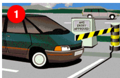
System Check and Login →