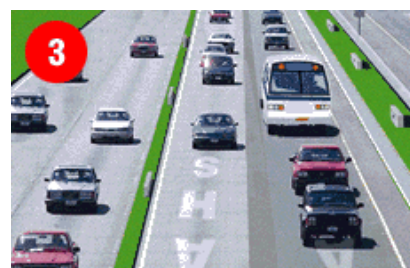
Automatic Drive (Platooning) →