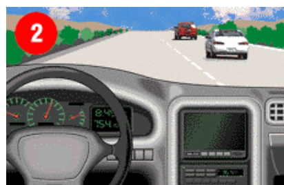
Navigation Info (Route, Stops, etc.) →