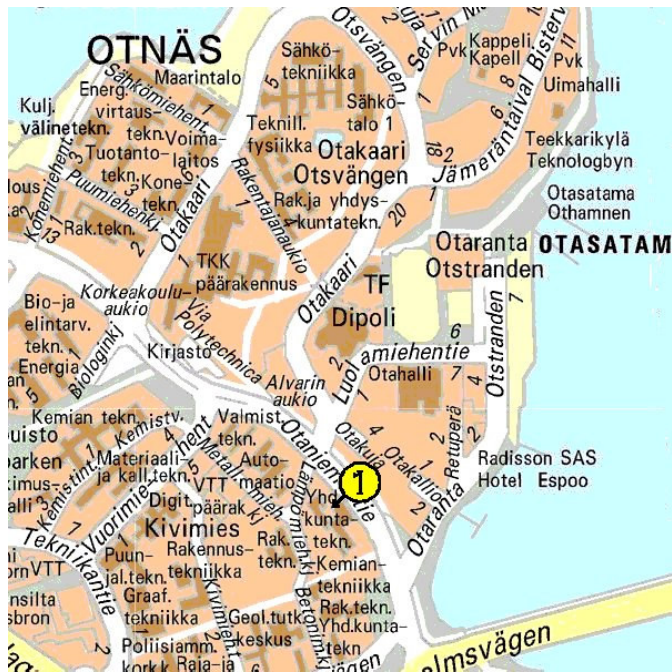
Map of Otaniemi. 1 VTT Building and Transport